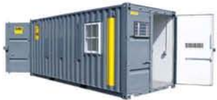
20' OFFICE COMBO