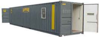
40' OFFICE COMBO